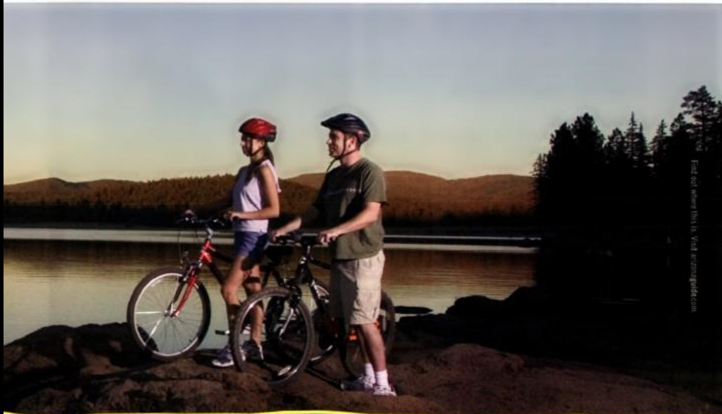
Find out where this is. Visit arizonaguide.com .

Grab life. Immerse yourself in a day full of adventure and a night full of fun. More to discover and definitely more than you expect, all waiting here for you. For your free travel packet, call 1-866-532-2498 toll-free or visit arizonaguide.com .